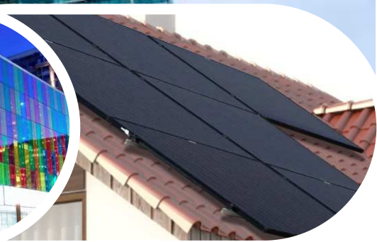
High Reflective Black Enamel