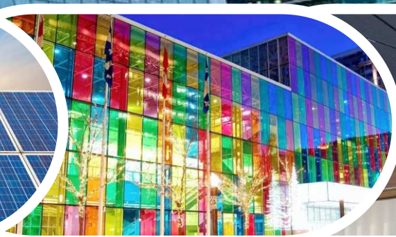
Highly Transparent Color Enamel