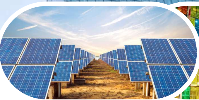
High Reflective White Enamel