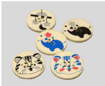
Printing on garment buttons