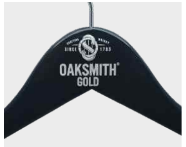
Printing on hangers & size tabs