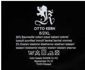
Printing on garment