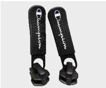
Printing on raised surfaces